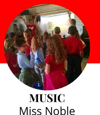
In music class, we have been preparing songs for Grandparents' Day and practicing performance skills. The Kindergarteners learned about melodies and melodic direction, the 1<sup>st</sup>-2<sup>nd</sup> graders have been learning about pitches, intervals and how to read notes on a staff. The 3<sup>rd</sup>-4<sup>th</sup> graders finished up learning about the classical

Plastic caps of all kinds & sizes - from water bottles, milk, shampoo, juice, lotion, etc. Needed by April 20.