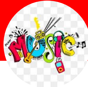
MUSIC Miss Noble