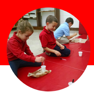
SCIENCE Mrs. Them

It is a pleasure to see the kids create a project they can be proud of and enjoy the process of creating as well!